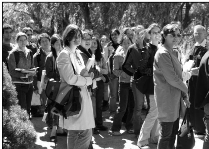
Undergraduate Art History students visited the Japanese Gardens at the Chicago Botanic Gardens to learn about Japanese landscape design for the Asian Art Survey, May 2004.