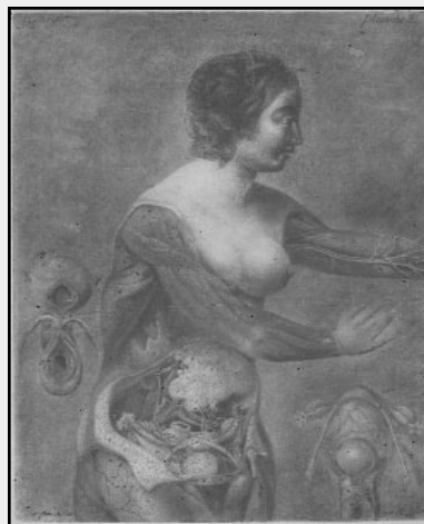
Anatomized female figure, mezzotint, from Jacques Fabien Gautier d'Agoty, Exposition Anatomique sur les Parties de l'Homme et de la Femme (Paris, 1773).

Sponsored by the Department of Art History, Alice Berlin Kaplan Center for Humanities, Science and Human Culture, and the Myers Fund.