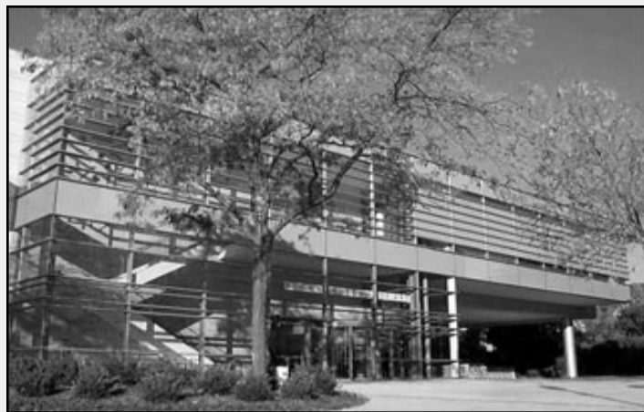
Mary and Leigh Block Museum of Art, Northwestern University