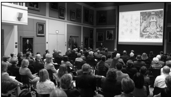
The capabilities of MIDA are demonstrated at the launch event.