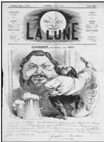
André Gill (André Gosset de Guine), from La Lune, no. 66 (June 9, 1867).

Co-sponsored by the Department of Art History and the Myers Fund.